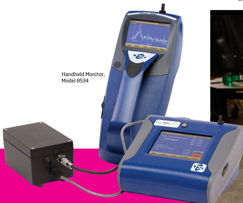
Handheld Monitor, Model 8534