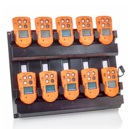
10 way charger For charging and storing your T4 fleet